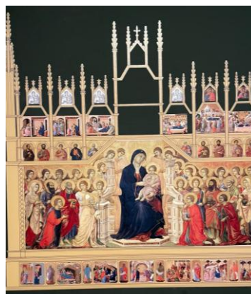
Front face of Duccio's Maesta Siena Cathedral 1300-11