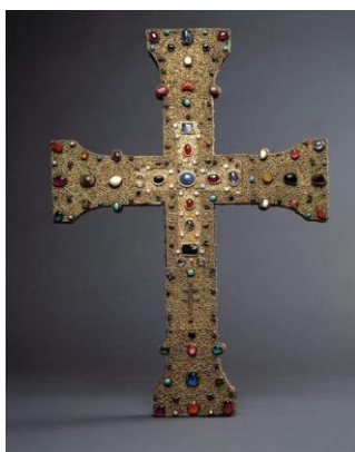
The Valasse Cross Story below