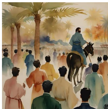
Entry into Jerusalem