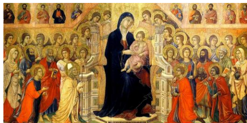
Maesta by Duccio in Siena