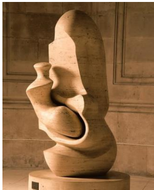
Mother and Child- by Henry Moore

Happy Mother's Day from St Paul's Cathedral: “👑 On Sunday, we celebrate mothers, mother figures, and all who nurture and care for us. Did you know that Mothering Sunday was once a day to return to your ‘mother church’: the church of your baptism, marriage, or confirmation? Cathedrals, too, are mother churches. Here at St Paul's, we are honoured to be the mother church of the Diocese of London, offering a place of faith, reflection, and community for all”.