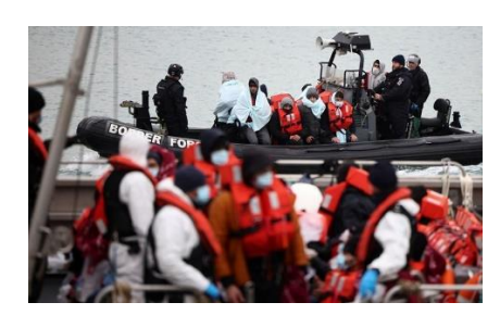
Migrants arrive in the Port of Dover in the middle of last month after a coastal-rescue operation in the English Channel

Writing above, as I have, about each doing their little bit of good, it is so welcoming to read of several of our bishops doing more than that by speaking out in the House of Lords against the Government's plans to tackle the asylum-seeker crisis. Those of us who have read the full proposals and opposed so much of them are totally supportive of the bishops. Please read through their critique (taken with thanks from the Church Times who reported on the debate fully). It is important for us to understand how cruel these proposals are towards other suffering human beings and that, far from having a wide number of "Safe Routes out for them, many have been shut down. This is never mentioned and people are forced into attempting to escape by smugglers.