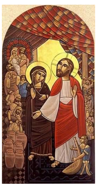
Icon - Water into wine

Greetings to everyone. We can all be hopeful now that there are signs of Spring and new beginnings around. Walking on Hampstead Heath last week I saw buds beginning to appear on some trees and felt so uplifted. The birds were singing their hearts out and the little Robin in my garden just doesn't stop from early morning to the evening. I remember last year you sent in some beautiful photos of blossom in trees, bushes and spring flowers in their full beauty near your homes. While it is a bit early for this yet please keep your eyes open and when you see something you want to share send it in so we can all enjoy it. Nature and its creative beauty keeps us going no matter whatever else is happening in the world. And there is a lot happening that is far from good in this country and elsewhere, which makes us angry, distressed, despairing and disappointed and often totally impotent to know what to do about it. We have to be honest about all these things, how we feel and face them. However, while we cannot completely prevent so many things, we can do what we can to try and alleviate them and, as Archbishop Tutu said, "Do your little bit of good where you are; it's those little bits of good put together that overwhelm the world." So let us do just that, in our different ways, and "overwhelm the world" to make a difference.