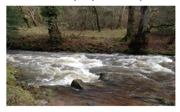
WATER A Reflection by Stephen Shakespeare

Glory to the God in the lifting air Glory to the God in the heat of the sun Glory to the God in the waters flow Glory be to God in the darkness of earth Glory to God in all creation.